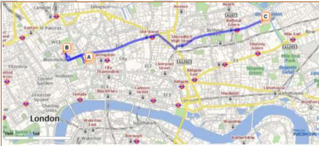
Map Powered by Yahoo

[A] Tyndalls Buildings [B] Ormond Children's Hospital [C] Victoria Park Cemetery